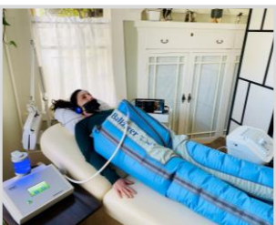
Client enjoying the NanoVi