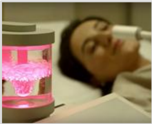
BIOLI Spa goer relaxing while repairing oxidative damage