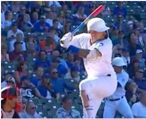
Nick Castellanos MLB player

"Life as a professional athlete can speed up very quickly. Balancing the work regiment required to feed the inner competitor and the ability to stay present with my family and friends can become difficult. My NanoVi® has become an anchor to keep me centered through this crazy journey we call life."