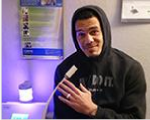
Justin Simmons, Pro Bowler and All-Pro

"NanoVi is a really huge part of my recovery process and getting my body acclimated to rigorous play. NanoVi, in terms of preventing and reducing all the oxidative stress levels, is huge for me and so this is a must-need for me before I play on Sundays."