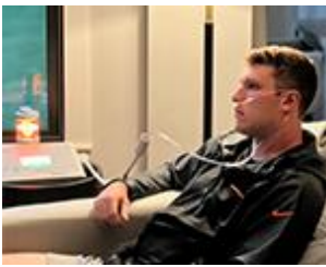
Drew Sample, NFL Tight End

"In the NFL you don't have to be injured to have a huge need for repair. I use the NanoVi device to help me recover faster and be in top shape for each game. It helps make everything work better."