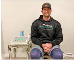
James Paxton MLB pitcher

"I've been using the NanoVi since the all-star break and have had great results. I am feeling less sore after workouts and getting better sleep at night."