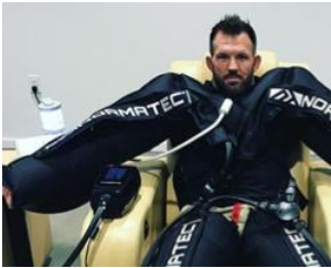
Pro MMA Fighter, Bellator Light and Heavyweight Champion, The Ultimate Fighter Winner

"NanoVi® Cellular Repair is a piece to the puzzle that has helped me and will continue to help me reach more goals."