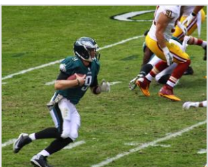
Nick Foles, NFL Superbowl MVP and NFL Champion

"The first time I visited Bulletproof Labs in Santa Monica, I learned about the NanoVi, a device that boosts your cells' own repair signals. I use the NanoVi to kickstart cellular repair."