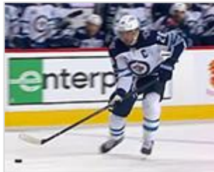
Blake Wheeler, NHL Forward

"I've been using my NanoVi machine for just about six months now. I've noticed a definite increase in my ability to recover from our very demanding schedule, both mentally and physically. I found that, you know, game in and game out. I felt refreshed and ready to play, and especially at my age, I'm 36 and not getting any younger."