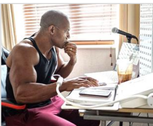
Bodybuilder, Fitness Trainer, WBFF European Champion 2013

“NanoVi is the ultimate innovation to support health, performance, and healthy aging... This device helps protect and reinstate protein functions. Loss of protein function results in oxidative stress. This is underlying cause of aging and chronic disease. The thing I love about this is it is suitable for everyone regardless of your goals.”