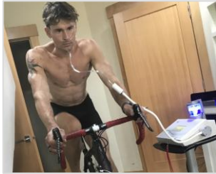
Ben Greenfield speaker, author, elite trainer

"NanoVi is one of the fastest, safest, most cutting-edge methods for DNA repair, faster recovery and extreme regeneration of tissue and cellular membranes. It's also one of the best things that you can do for your mitochondrial health, your longevity and is a perfect addition to any anti-aging or fitness or recovery protocol."